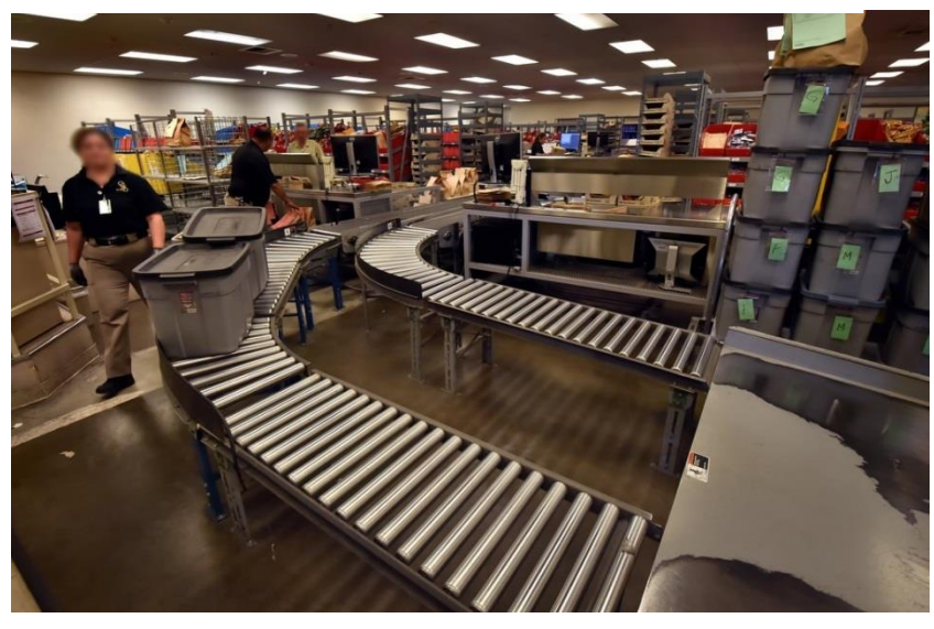
Figure 3 - Orange County Sheriff's Jail Commissary

During the visit, the Grand Jury noted that all Commissary items were neatly stored, easy to identify and access, and that the ordering system was efficiently operated.