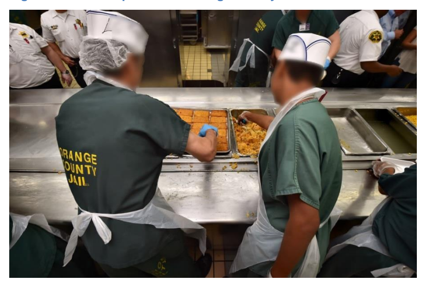
Figure 1: Food Preparation at Orange County Jail

All meal preparation is supervised by FSU cooks, who are certified California Food Handlers, while inmate food handlers and FSU cook staff handle the actual preparation, service and cleanup. Food preparation utilizes the cook-serve method by which hot cooked food is served immediately to inmates. Other cafeteria service facilities commonly use this method.