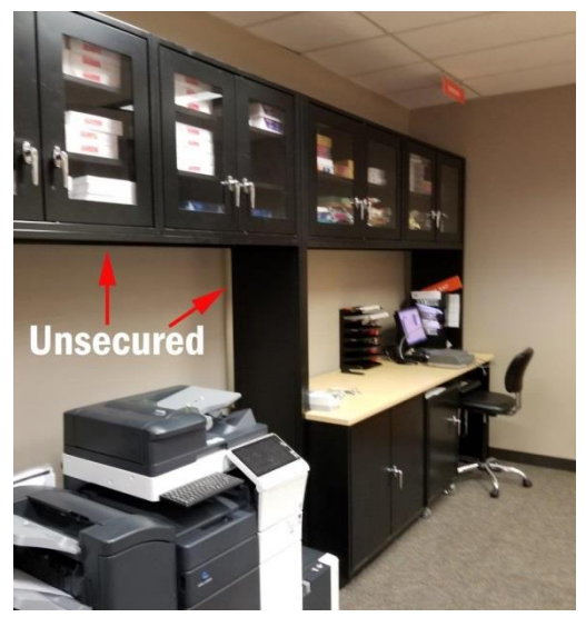
Figure 5: Office area at the Emergency Operations Center

Throughout the EOC are offices and meeting rooms which contain computer equipment; office equipment; wall-mounted televisions and screens; and bookcases, cabinets and closets full of books, manuals, and office supplies. The Grand Jury observed that office equipment and storage cases have not been properly secured to work stations or to the walls. In the event of a major earthquake, equipment could be damaged or made inoperable, potentially impairing emergency operations. Unsecured equipment, books, manuals, and office supplies could become airborne, causing serious injury to EOC staff and emergency responders.