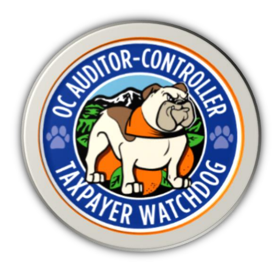
OC Auditor Controller Watchdog Logo