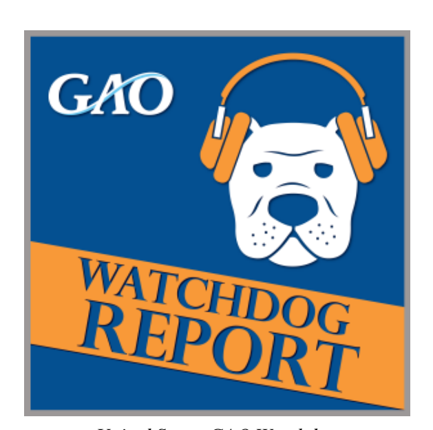
United States GAO Watchdog