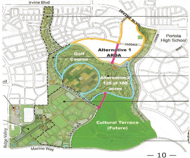
MAP 2: This City-provided map shows the proposed location for the Veterans Cemetery (Alternative 2), replacing twothirds of the proposed golf course that was to be developed by FivePoint.